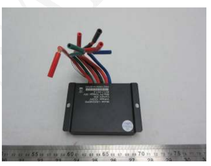
BACL authenticate the photo on original report only